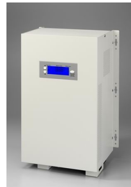
Wall-mount for 800VA/1200VA Wall-mount for 1600VA~8KVA Tower for 800VA ~ 4KVA